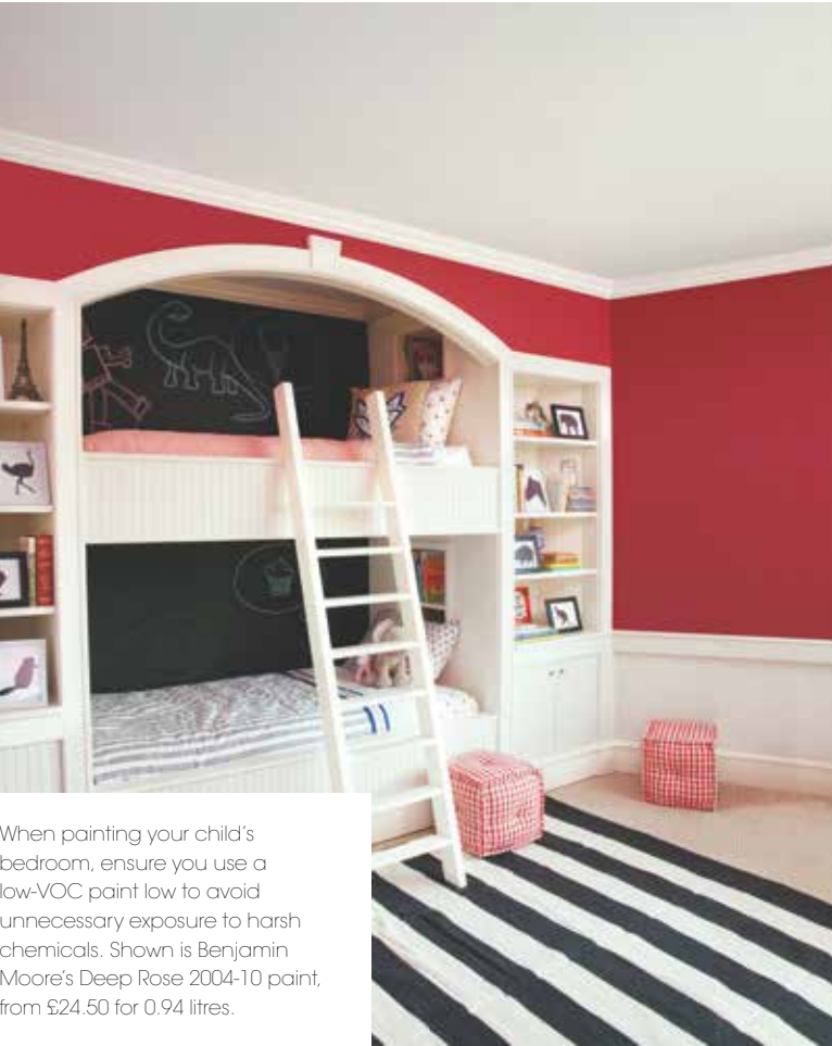
When painting your child's bedroom, ensure you use a low-VOC paint low to avoid unnecessary exposure to harsh chemicals. Shown is Benjamin Moore's Deep Rose 2004-10 paint, from $24.50 for 0.94 litres.