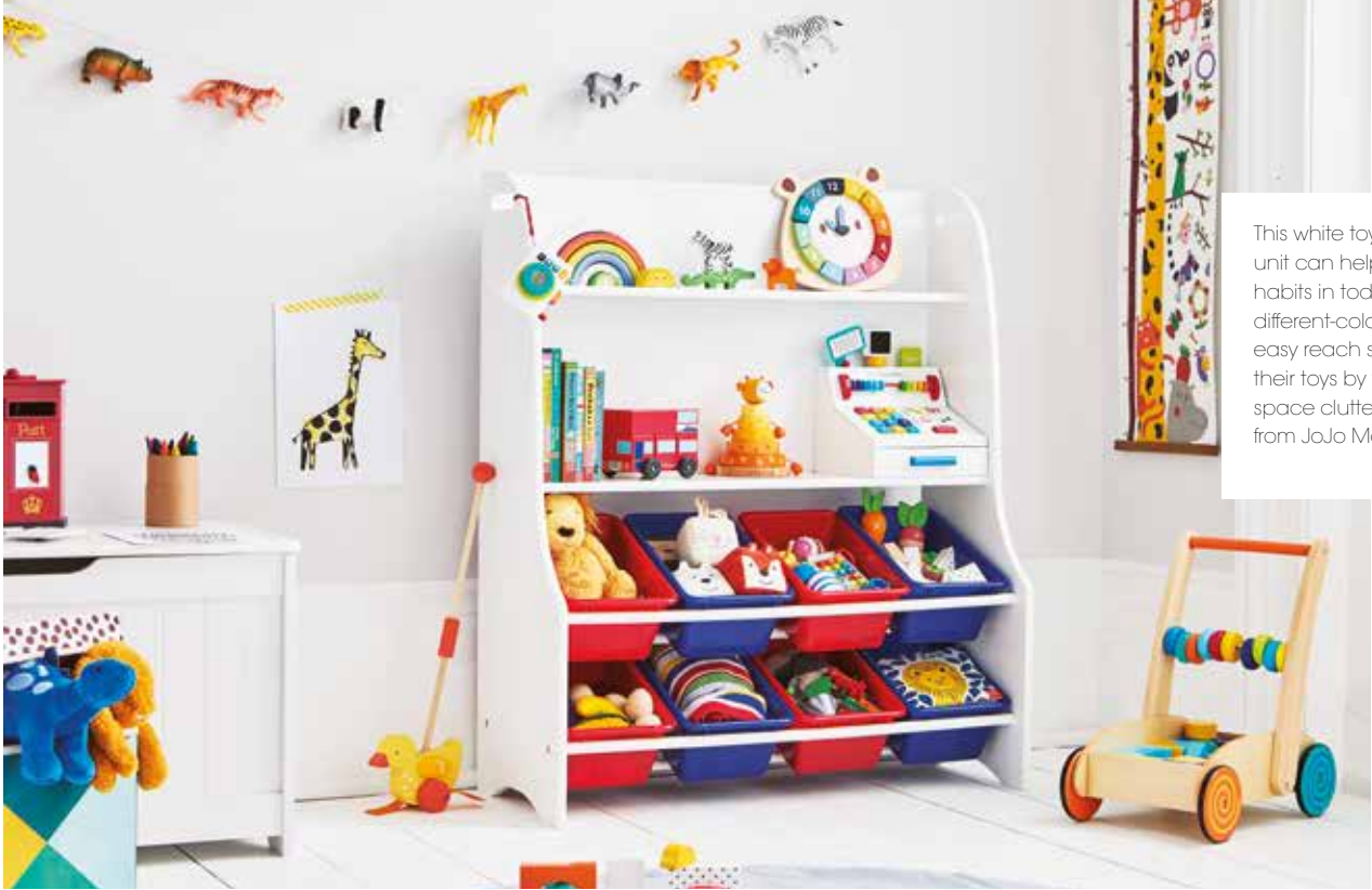
This white toy sorter storage unit can help encourage tidy habits in toddlers. It comes with different-coloured boxes within easy reach so they can sort their toys by type and keep the space clutter free. Priced £99 from JoJo Maman Bébé.