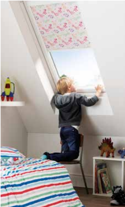
Right Fun and practical, these animal-themed blackout blinds do not feature any potentially hazardous hanging cords. Zoo Time black out blinds, from $57, Keylite Blinds.

As they start school, you might want to introduce a desk or table area into the room. Keep the design light and fun to encourage creativity.