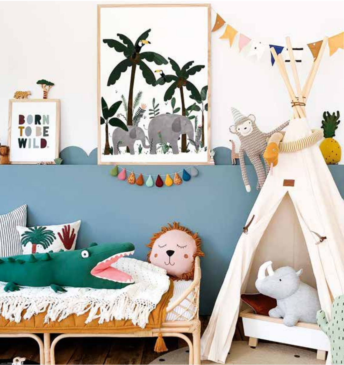
Left Accessories can make a world of difference in bringing your toddler's room to life and making it an engaging space to be in. The cushions, artwork, accessories, teepee all shown are available at Scandibørn and start from £18.95.