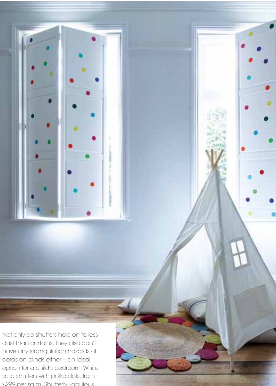
Not only do shutters hold on to less dust than curtains, they also don't have any strangulation hazards of cords on blinds either – an ideal option for a child's bedroom. White solid shutters with polka dots, from £299 per sq m, Shutterly Fabulous.