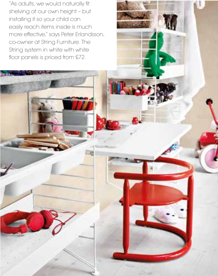
"As adults, we would naturally fit shelving at our own height – but installing it so your child can easily reach items inside is much more effective," says Peter Erlandsson, co-owner at String Furniture. The String system in white with white floor panels is priced from $72.

As your child gets older, tailor a room around their interests if you can – then they are more likely to enjoy spending time in the space. Hide and Seek fabric, $22.80 per sq m, and Peek A Boo Jungle wallpaper, $140 per roll, both Prestigious Textiles.