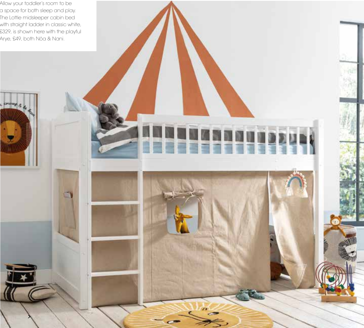
Allow your toddler's room to be a space for both sleep and play. The Lottie mid sleeper cabin bed with straight ladder in classic white, £329, is shown here with the playful Arye, £49, both Nöa & Nani.