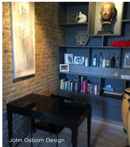
John Osborn Design