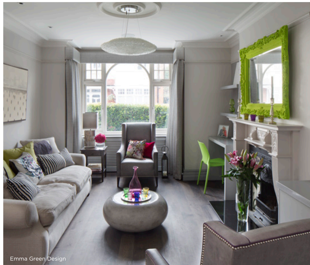
Emma Green Design

living room, complete with storage, seating and desk space. "Working in this area means that you are not totally shut away from your family, and this room often has console tables you can re-purpose."