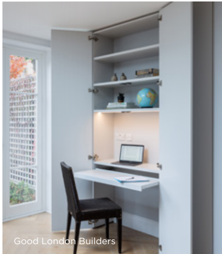
Good London Builders