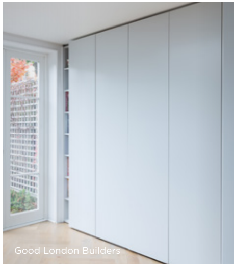
Good London Builders