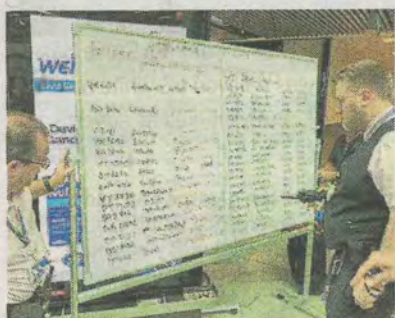
Plane B: Workers adopt basic approach

FLIGHTS ARE MISSED AS SCREENS GO WRONG ■ STAFF WRITE DEPARTURES ON WHITEBOARDS