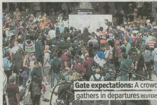
Gate expectations: A crowd gathers in departures